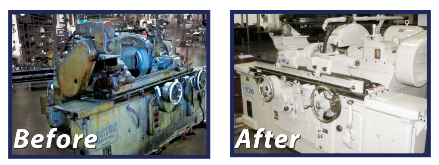
Norton Grinder Machine Rebuild